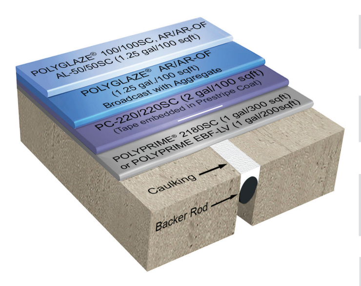
Plywood/Concrete Substrate (properly prepared substrate)