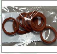
Replacement Silicone Rubber O-Ring (Package of 10 pcs)