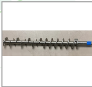
Injector Screw-Machined from Solid