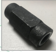
3/4" High Pressure Check Valve