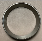
Tapered Roller Bearing Race