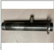
Screw Shaft Bearing Outer Race