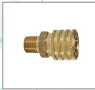
3/4" Male Quick Connect Coupler