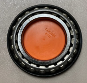
Tapered Roller Bearing and Seal