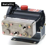
B-Side (CAT) Water Base Pump