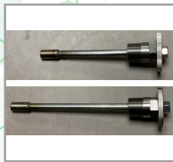
Standard Length Core Plunger and Seal Assy Extended Length Core Plunger and Seal Assy