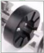
QF15TINSERT HP Black Cushion