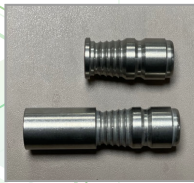
Valve Stem Adapter - Standard Length Valve Stem Adapter - Extended Length