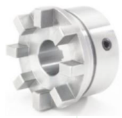
QF15X1-7/16 Coupling Hub