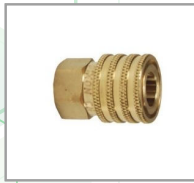
3/4" Female Quick Connect Coupler