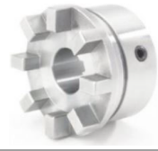
QF15X1 Coupling Hub