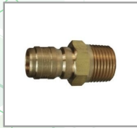
3/4" Male Quick Connect Insert