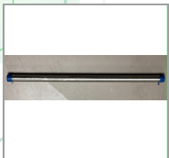
3/4" Stainless Steel Mixer Tube