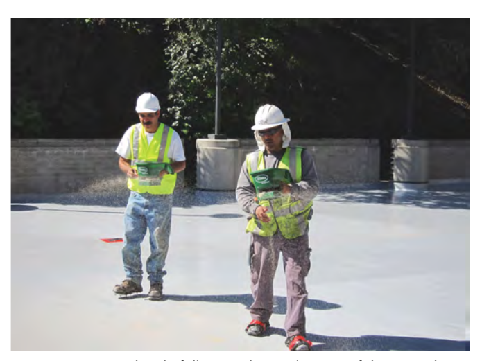
ABOVE ☐ Immediately following the application of the second coat of PC-235SC, the crew broadcast Monterey sand #1/20 mesh into the wet coating to create a slip-resistant finish