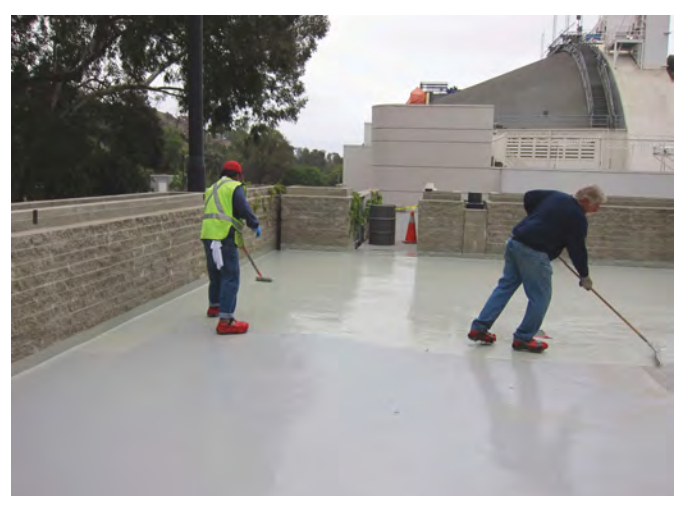
ABOVE ▲ After they mapped out the high traffic areas, the crew applied a second coat of the PC-235SC to those sections at a thickness of approximately 11 mils (279.4 microns).

100SC. With these curing accelerants, the cure times were back on track, and the crew didn't waste time standing around in the unseasonably chilly weather.