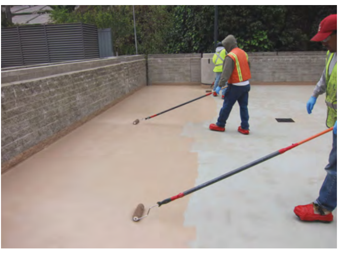
BELOW ▼ The crew used squeegees and rollers to apply the Polyglaze 100SC topcoat in two 12 mil (304.8 microns) thick topcoats.

In addition, each crew member wore the appropriate personal protective equipment (PPE) for various stages of the job, including goggles, gloves, hardhats, boots, and respirators.