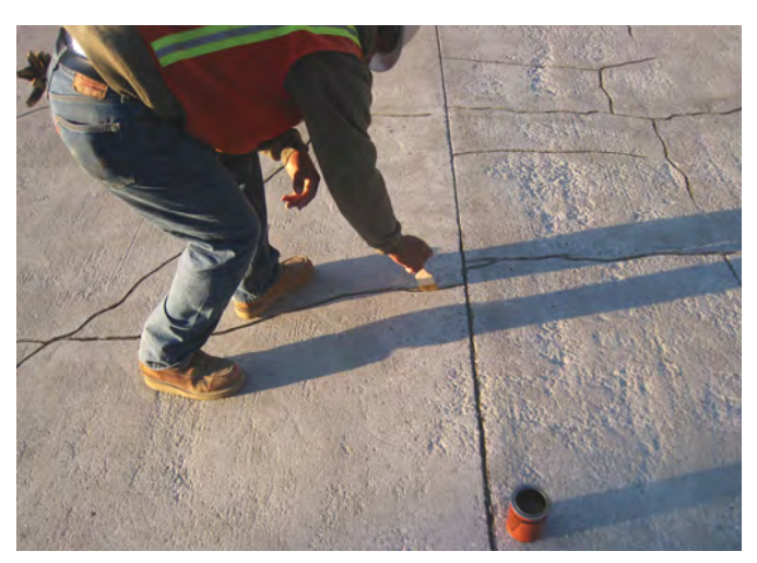
ABOVE — The crew used a two-part, gun-grade sealant to prime and caulk cracks and control joints. According to Gilbertson, any excess caulking was removed, and the sealant was tooled.

the two-week-long coating job. "The project took place during January and February 2012, when the Los Angeles area saw unusually low temperatures and very low relative humidity," says van der Capellen.